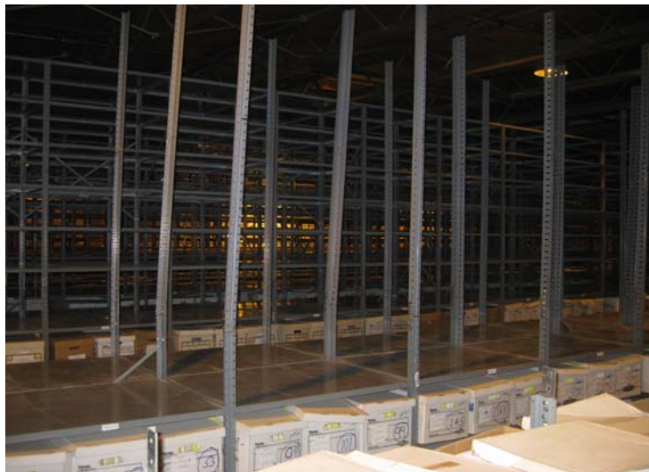
The modification of the shelving units, Summer 2011.